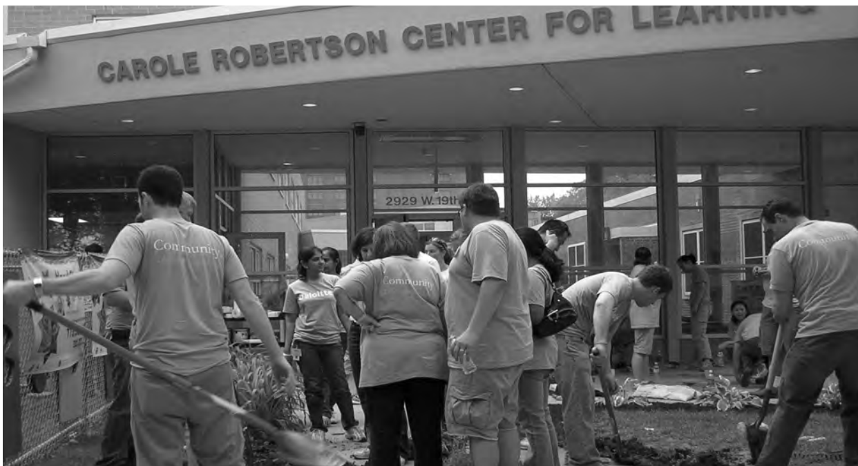
Deloitte staff implement IMPACT Day 2008 through a major playground improvement project (left, below).