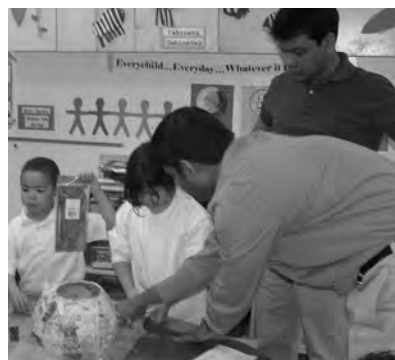
Top: Deloitte staff volunteer at a Learning Rotation for children.