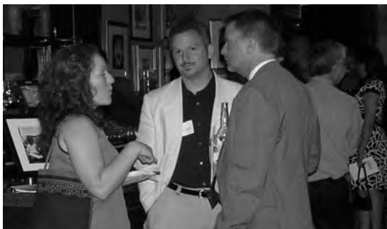
Above: CRCL Board members and friends enjoy the atmosphere at Carnivale.

The evening culminated in a raffle drawing, which consisted of prizes donated by downtown and west side businesses, all of who support the mission of the Center.