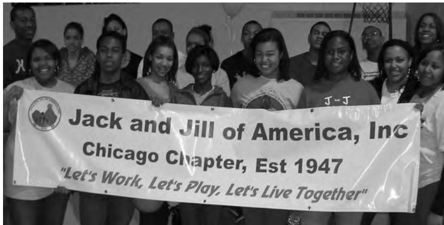
Left: Jack & Jill of America's Chicago Chapter displays its banner after a successful day of volunteering at the Spring Health Fair 2008 health and wellness event.