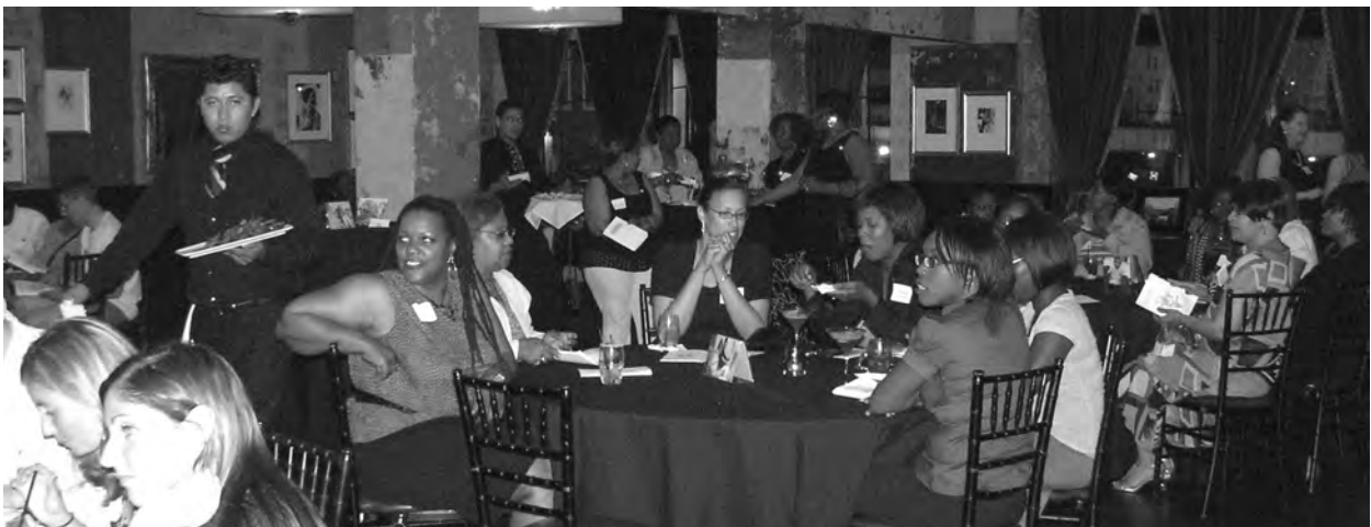
Below: Community partners, corporate groups, staff, and guests celebrate the Center's success while waiting for the results of the silent auction fundraiser (left, middle).