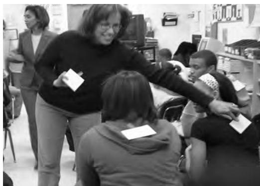
Below: Jack & Jill of America's Western Cook County Chapter unites with the Center's youth to discuss healthcare issues affecting minority groups.